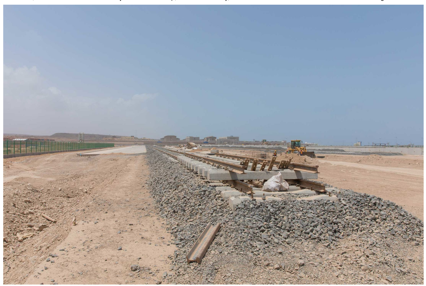
An unfinished rail line near the Chinese People's Liberation Army support base.