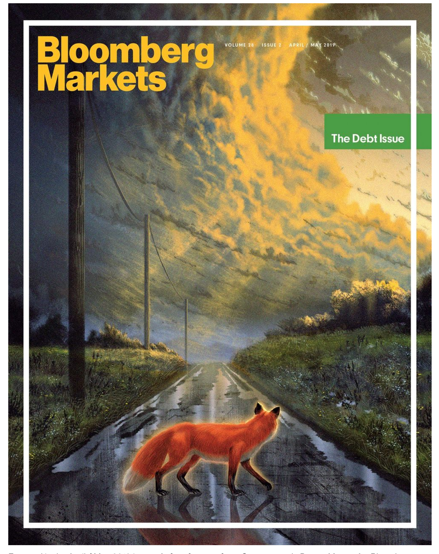
Featured in the April / May 2019 issue of Bloomberg Markets . Cover artwork: Dexter Maurer for Bloomberg Markets

The U.S. has been beating this drum even more loudly than the French. "China uses bribes, opaque agreements, and the strategic use of debt to hold states in Africa captive to Beijing's wishes and