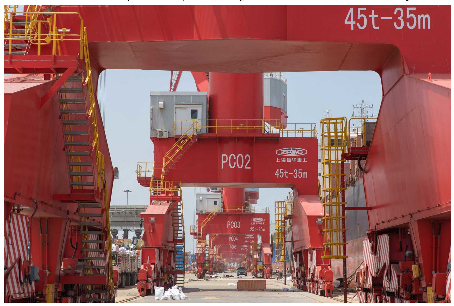
The Doraleh Multi-Purpose Port.

China's bridgehead here is part of its globe-girding "Belt and Road" initiative, an amalgam of economic strategy, foreign policy, and charm offensive that's fueled by a torrent of Chinese money and is designed to rebalance global alliances. And as with dozens of other way stations along this new Silk Road, Djibouti's dalliance with China is raising hackles from Paris to Washington. China has no qualms. "China-Africa cooperation is yielding fruitful results all across Africa, bringing tangible benefits to every aspect of local people's lives," Foreign Ministry spokesperson Geng Shuang said at a press briefing on March 18. "It is these people who are in the best position to judge the effects of China-Africa cooperation projects."